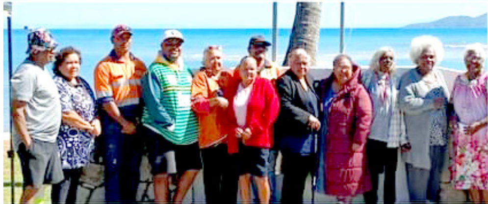
CHILDREN & RELATIONS OF OUR 7 FALLEN HEROES